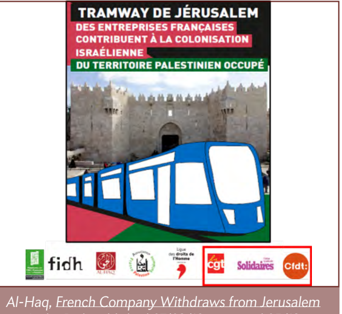
Light-Rail, published 07/02/18, accessed 05/19

In addition, in May 2015, Al-Haq, along with French NGOs and two French unions – the General Confederation of Labor (CGT) and the Union Syndicale Solidaires – which both support the BDS Movement,<sup>168</sup> published a report about the involvement of Orange S.A. (formerly France Télécom S.A.) with the Israeli telecommunication company Partner.<sup>169</sup> This report was published as part of the "Made in Illegality" campaign,<sup>170</sup> designed to pressure officials in Belgium, France and the EU to "stop supporting the settlements