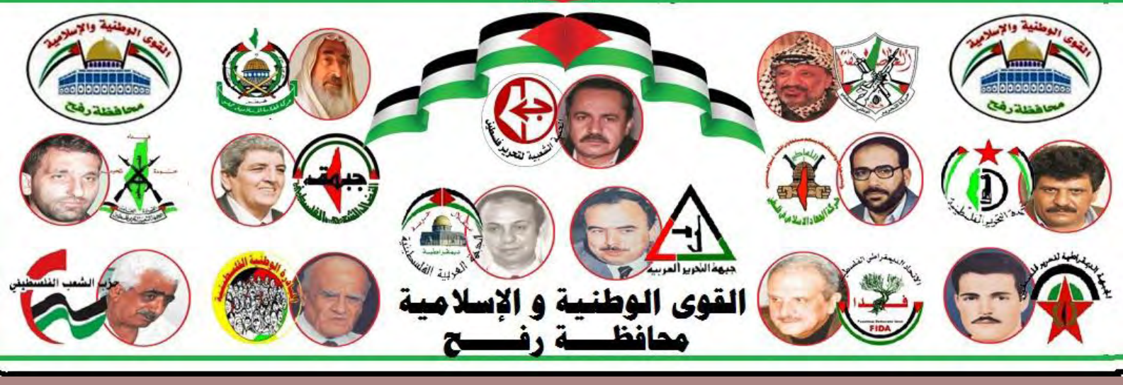
PNIF, Facebook cover photo, published 11/15/16, accessed 01/20