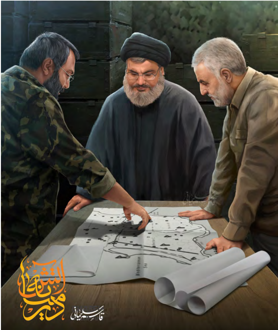
A painting of Imad Mughniyeh (left), briefing Hassan Nasrallah and Qasem Soleimani with a map showing military maneuvers from the 2006 Second Lebanon War.

Qasem Soleimani came to Lebanon to help manage the war. Because Beirut and the means of access to it were under bombardment and Israel had destroyed bridges and roads leading to the Lebanese capital, Nasrallah tried to convince him to remain in Damascus. Imad Mughniyeh went to Damascus and brought the Quds Force