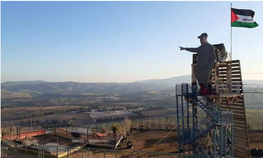
Hizbullah outpost in Southern Lebanon flying the Palestinian flag, showing sculpture of Qasem Soleimani pointing toward the Galilee across the Israeli border.