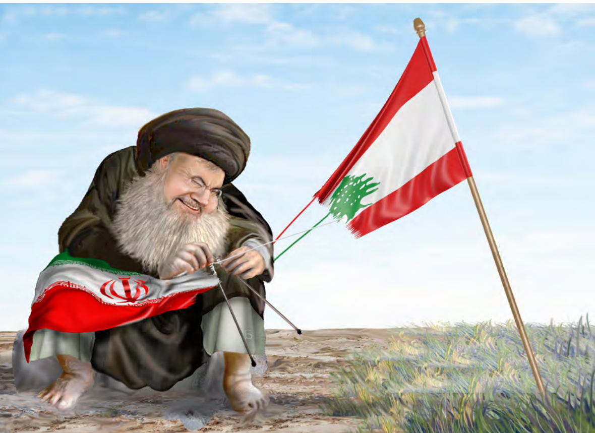
Hassan Nasrallah unravelling the Lebanese flag, reknitting it into the flag of Iran.