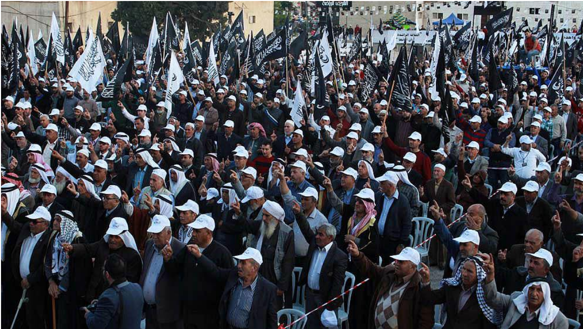
Hizb ut-Tahrir rally in Hebron, May 7, 2016

In one case, the Commerce Bureau – whose composition, as observed earlier, is determined by the large clans – undermined a stance that Hizb ut-Tahrir had taken. The Islamic party has a worldwide reach, and it has clashed with Russia within Russia itself and also, of course, in Syria. 21 After Hizb ut-Tahrir organized a demonstration against Russia in Hebron, 22 the Commerce Bureau still invited a Russian delegation for an official visit. 23