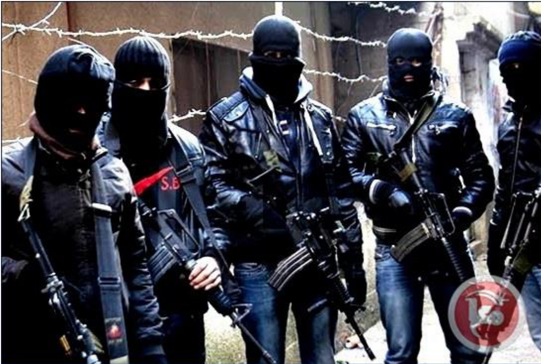
Aqsa Martyrs 60

Shak'a was forced to resign in August 2015 following mass demonstrations opposite the municipality over water and electricity stoppages at the apex of the summer heat. The problem was not really solved, and now, as another summer intensifies, it will be interesting to see how the municipality responds to the crisis that is sure to come. The burning tires in the Rafidiya neighborhood could be omens.