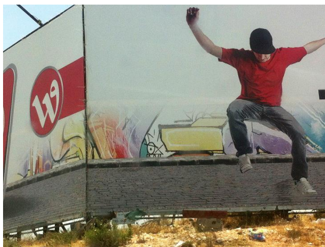
A billboard near the separation fence in Ramallah is sponsored by the Wataniya mobile phone company. It shows a Palestinian hopping over the fence into Israel.

In Hebron the large clans and the merchant class look out for the local interests. In Ramallah, the PLO top brass sits in the governmental compound, the Muqata , and keeps disorderly demonstrations out of the city center, deflecting them to the security fence or to points of friction with Israel.