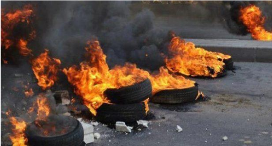
Burning tires in Nablus.

Indeed, the tire-burning that was a regular feature of the first Intifada is now a daily reality in Nablus. Here, for example, the Nablus website shows tire-burning in the Rafidiya neighborhood in protest of the municipality's failures. 49