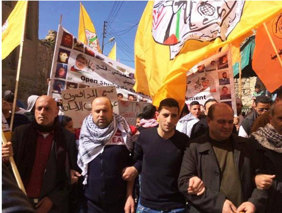
A sparse Fatah demonstration in Hebron, February 28, 2015

As for the Fatah movement, it turns out that it cannot muster mass rallies even though it holds the governor's office. 15 The simple reason is that the large clans, with their power and their Islamic nature, do not encourage the kind of large-scale disorderly events that are typical of Fatah's activity.