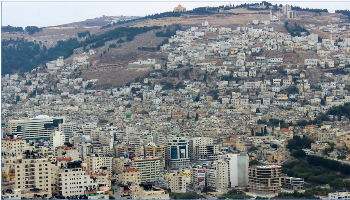
Nablus. Note the palatial home of Munib al-Masri, on the horizon 44

The assassination sparked a flurry of reactions on Nablus Facebook pages; all of them pointed to the severe strife within Fatah as forming the background for the act.