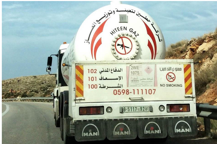
A gas delivery truck near Ramallah with “don’t shoot” sign. How far have things deteriorated? (Pinhas Inbari)

Ramallah’s loss of control over the West Bank districts raises questions about its ability to run a state and play its part in ensuring not only Israel’s and Jordan’s security, as required by various agreements and the rules of conduct between neighboring states, but even its own security.