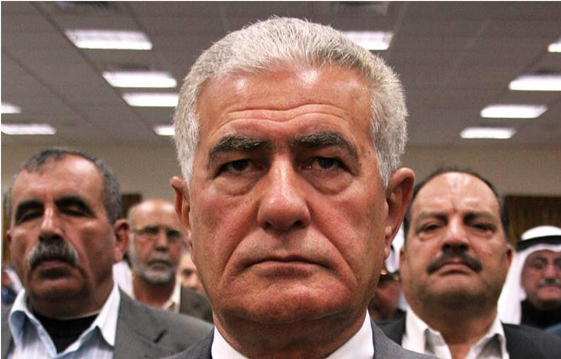
Abbas Zaki, Fatah Central Committee, and former PLO representative to Lebanon

However, it turns out that this “Fatah village,” too, has given priority to the pragmatic interests of Mount Hebron over the “spirit” of the “Fatah struggle.” When the militant governor of Hebron, Kamel Hmeid, came to the village to praise it for its “sacrifice,” he was surprised to find that the village notables had summoned him to a discussion behind closed doors in which they demanded that he stop sending the youths of the village to their deaths. Indeed, since then, the village of Sei’r has ceased to dispatch knife attackers.