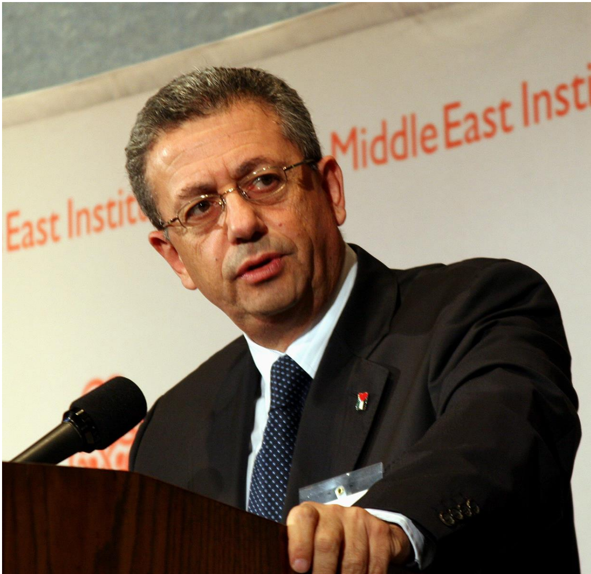
Mustafa Barghouti (Aude)

Two of these PNGOs' prominent figures – Mustafa Barghouti, head of the Palestinian National Initiative and the Palestinian Medical Relief Committees, and PA Foreign Minister Riyad al-Maliki – are also among the most harshly anti-Israeli figures. Barghouti makes use of atrocity propaganda about Israel, and Maliki, as foreign minister, wages the diplomatic battle against Israel behind the scenes. Both of them came from the radical anti-Israeli left – Maliki from the Popular Front, which he represented at the headquarters of the First Intifada in Orient House, and Barghouti from the Palestinian Communist Party. Both are also active in the BDS campaign against Israel.