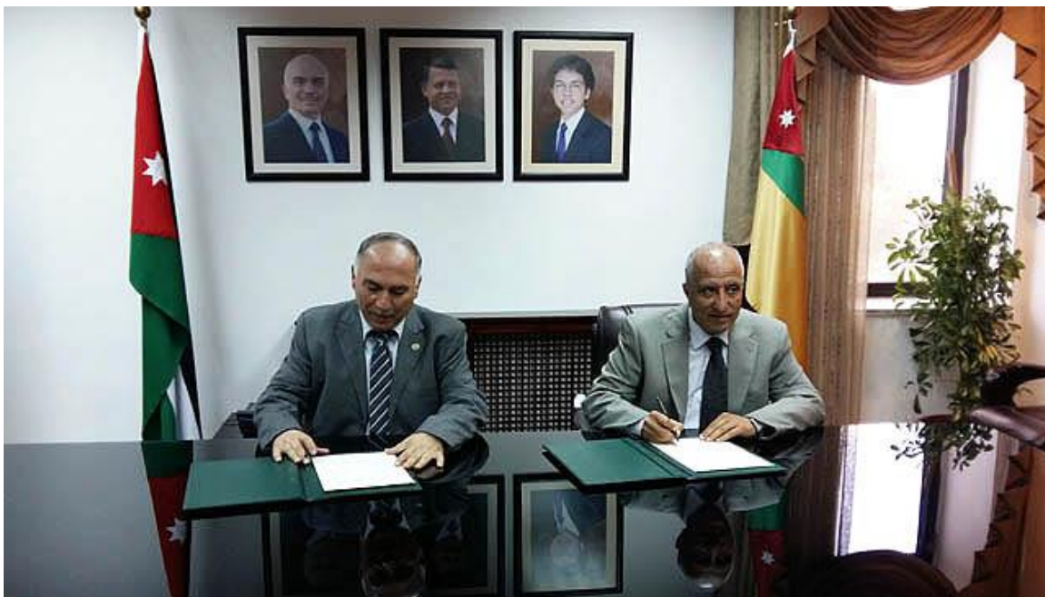
Heads of Hebron University and University of Jordan sign agreement in Amman

In Hebron, for instance, the large clans of Mount Hebron have linked up with each other, reestablished the Tribal Council of Mount Hebron, and sent a delegation to Amman to express loyalty to the king of Jordan under the Jordanian flag.