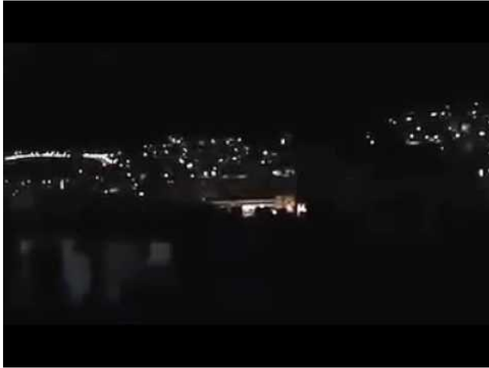
Clip of gun battle in Nablus, uploaded June 11, 2016 47 .

The anarchy stems from the longstanding struggle between the large refugee camps of Balata and Askar, on the one hand and the city of Nablus itself, on the other. Unlike in other West Bank cities, the largest refugee camps are actually located along the main route in Nablus, very close to the casbah, hence strongly affecting the life of the city.