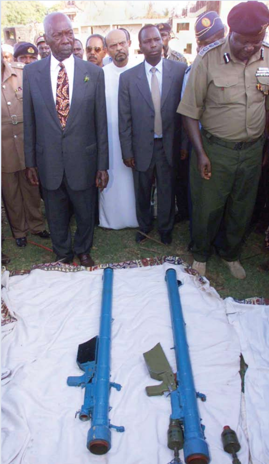
Kenyan President Daniel Arap Moi views missile launchers, at the Paradise Hotel north of Mombasa used in a failed SA-7 shoulder fired missile attack by Al-Qaeda on an Israeli passenger jet on Nov. 29, 2002. The plane with 261 passengers and 10 crew members landed safely in Tel Aviv with no casualties, but 16 people were killed in a simultaneous suicide bombing on the Israeli-owned hotel