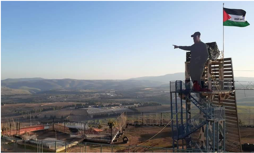
Hizbullah outpost in Southern Lebanon flying the Palestinian flag, showing sculpture of Qasem Soleimani pointing toward the Galilee across the Israeli border.