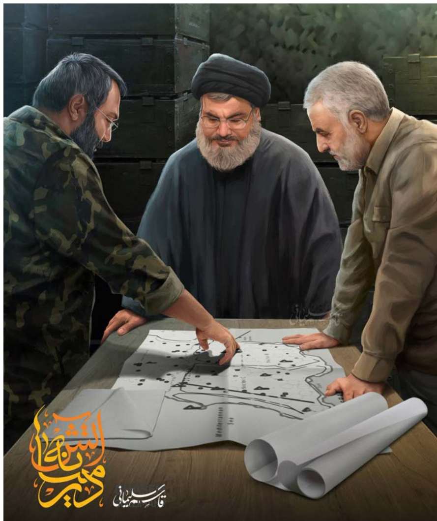
A painting of Imad Mughniyeh (left), briefing Hassan Nasrallah and Qasem Soleimani with a map showing military maneuvers from the 2006 Second Lebanon War.

Qasem Soleimani came to Lebanon to help manage the war. Because Beirut and the means of access to it were under bombardment and Israel had destroyed bridges and roads leading to the Lebanese capital, Nasrallah tried to convince him to remain in Damascus. Imad Mughniyeh went to Damascus and brought the Quds Force