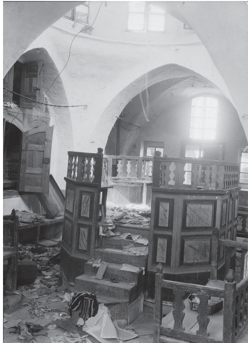
The destroyed Avraham Avenu Synagogue in Hebron. 29

The American Colony archives also contain a series of photographs taken immediately after the massacre of the Jewish community of Hebron in 1929. The pictures show synagogues and homes with bloodstained floors and Torah scrolls strewn on the ground. The leaders of the present Jewish community of Hebron told this writer that they had never seen the pictures before.