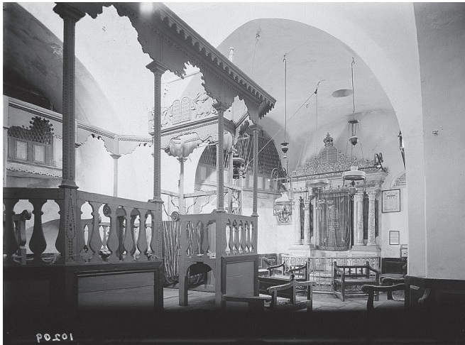
The Istambouli Synagogue (ca. 1935). 20