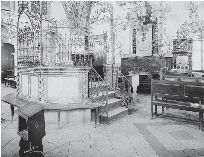
Ohel Yitzhak Synagogue (ca. 1900). 18