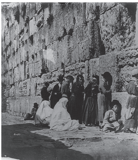
“Wailing Place of the Jews, Solomon’s Wall,” Jerusalem. The Frenchman Felix Bonfils was the photographer and the picture can be dated to 1865. The subjects were almost certainly posed. 4