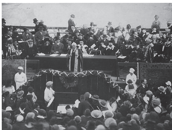
Lord Balfour dedicating The Hebrew University (1925). 38