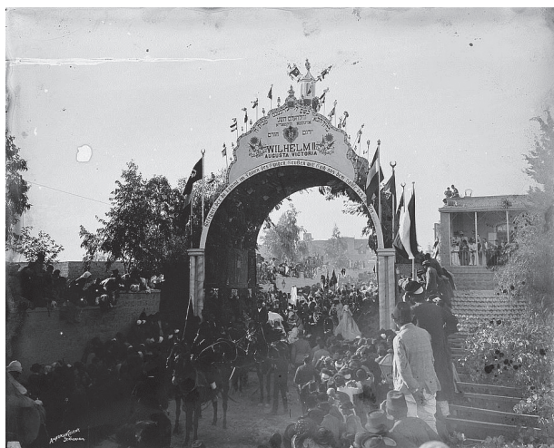
The Kaiser passes Jewish crowds and through the Jewish arch, bedecked with Torah crowns and curtains from the arks. (See the enlarged curtain with a dedication from the Istambouli synagogue.) Beneath the arch await the chief rabbis and other Jerusalem dignitaries (1898). 23

The pictures show the Jewish population, predominantly ultra-Orthodox, lining the roads and rooftops in their Sabbath finery. At the community's elaborate arch built for the Kaiser's parade route, the chief rabbis are photographed along with Jewish ritual treasures on display, including Torah crowns and curtains taken from the synagogues' arks. By enlarging the pictures, we can read the names of three Old City synagogues on the curtains.