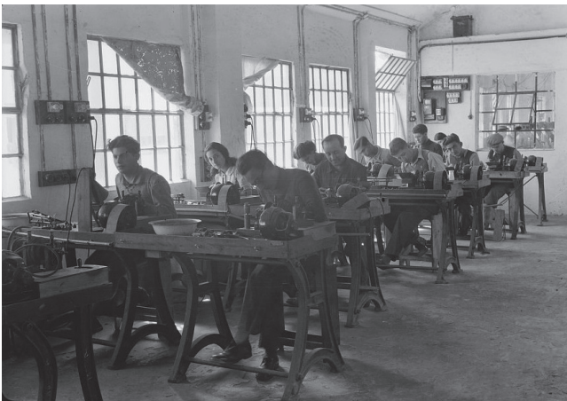
Diamond polishing factory (1939). 36