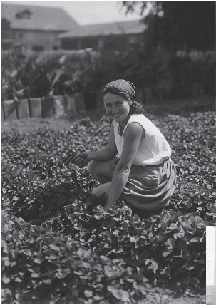
Girl student farmer in Nahalal (ca. 1930). 34