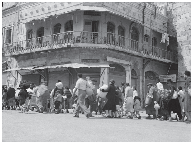
Expulsion from the Old City in 1936. 28