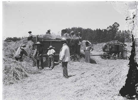
Harvesting at a Jewish colony (ca. 1898). 26