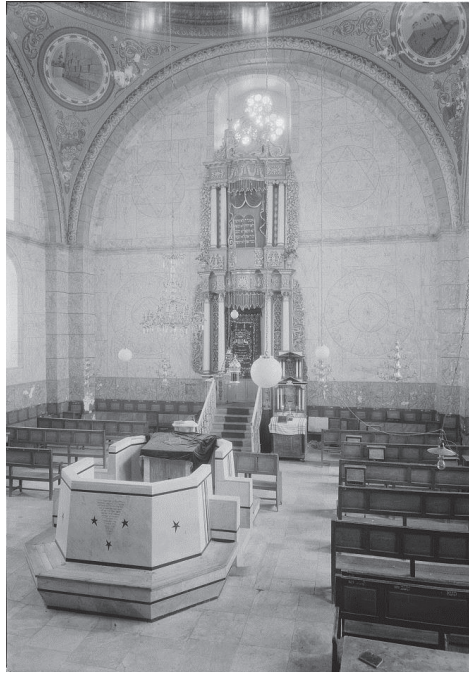
The Hurva Synagogue (ca. 1935). 19