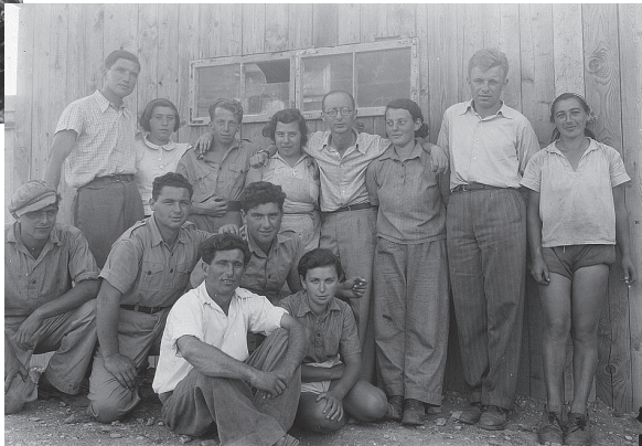
Pioneer settlers at Ein Gev on the shores of the Sea of Galilee, including Teddy Kollek (second from right), later to become mayor of Jerusalem (1937). 35