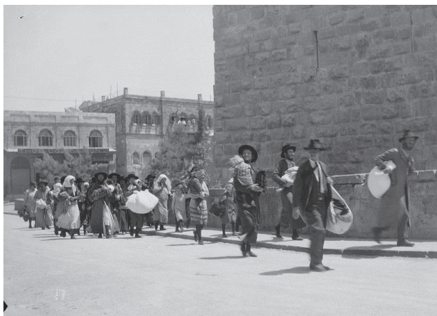
Expulsion from the Old City in 1929. 27

The American Colony's photographs of the expulsion of Jews from Jerusalem's Old City in 1929 and 1936 are haunting reminders of the Arch of Titus relief of Jewish slaves after Jerusalem's fall in 70 CE.