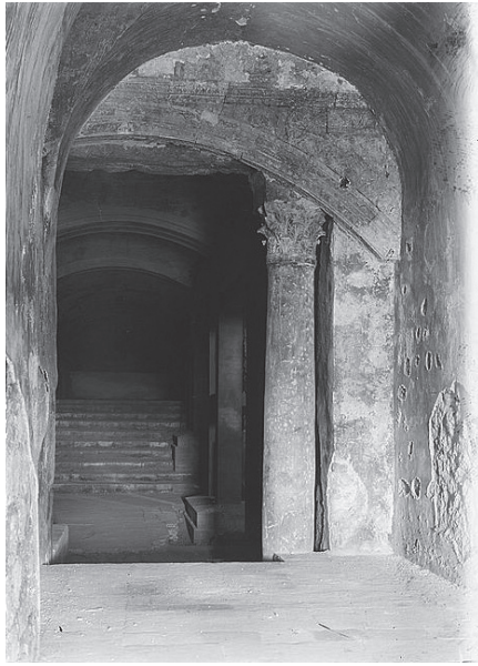
“The Temple area. The Double Gate. Ancient entrance to Temple beneath Al-Aqsa.” Note the staircase that apparently led to the surface and the Temple plaza. 17