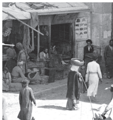
Jewish millinery store at Jaffa Gate (circa 1895) and enlargement. 3