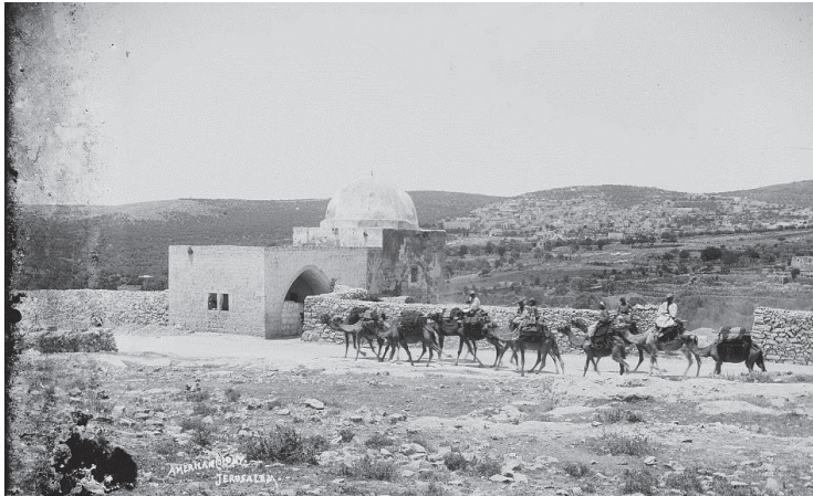
Rachel's Tomb (ca. 1900). 15

because he has shown mercy to us & our children & little ones. Therefore may the Lord make his days long...and may the Lord's mercy shelter them. In his and in our days may Judah be helped [?] and Israel rest peacefully and may the Redeemer come to Zion, Amen. 14