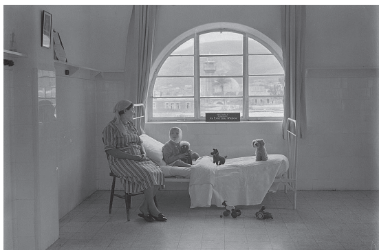
Little Jewish boy patient in Tiberias.

Illustrative of the willful distortion and erasure of Jewish history in these antique pictures, the BBC recently ran this picture as part of a review of the hotel now situated in the renovated hospital. They published the falsified caption, “Patients came from as far away as Syria,” making no mention of the original text which described the “little Jewish boy patient.” 32