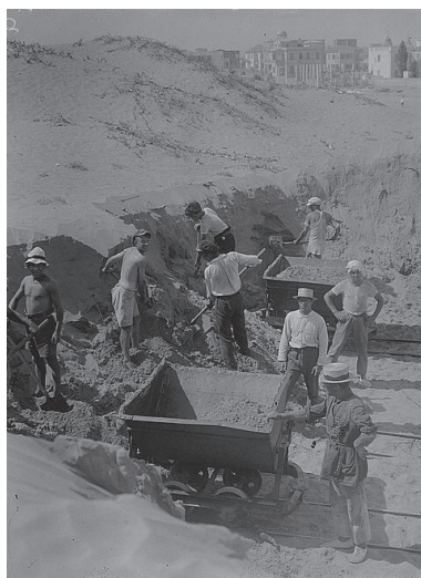
Clearing dunes to build Tel Aviv (ca. 1920). 33

The American Colony photographers also documented the building of the Zionist state with hundreds of photos of the construction of Tel Aviv, the Haifa port, the Iraq-Haifa oil pipeline, the massive Dead Sea Works, kibbutzim, moshavim, and factories. Agricultural farms, vineyards, and wineries are well represented. Agricultural students working in various farming activities were favorite subjects of the photographers, especially when they were attractive young women.