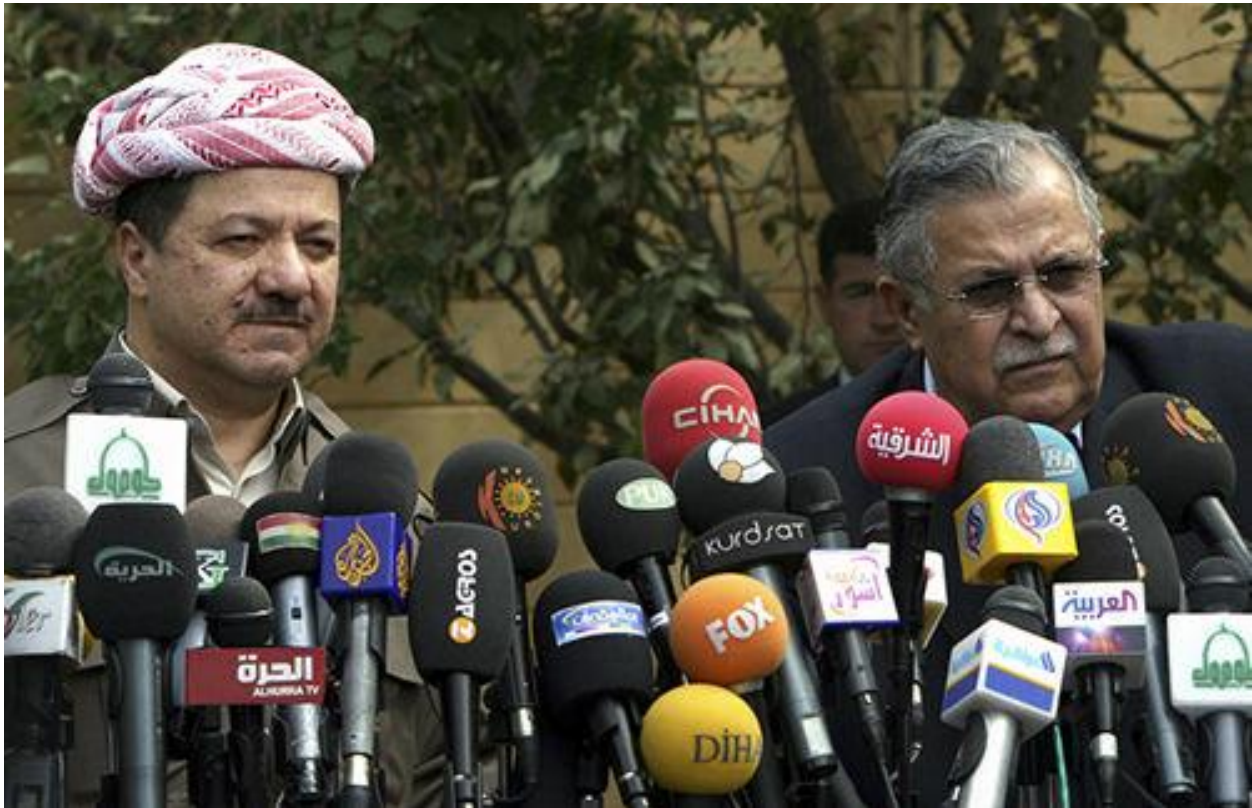
Iraqi President Jalal Talabani, right, holds joint news conference with Massoud Barzani, left, leader of Iraq's Kurdish region, on Oct. 21, 2007

In the wake of the steady disintegration of the Assad regime, Syrian opposition activists reported that several towns, such as Amouda and Qabani in Syria's Kurdish northeast, had passed in mid-July 2012 without a fight into the local hands of a group called the Free Kurdish Army. Thus emerged for the first time in modern Kurdish history the nucleus of an exclusively Kurdish-controlled enclave bordering the predominantly Kurdish areas of Turkey. After largely sitting on the sidelines of the Syrian revolution, political groups from Syria's Kurdish minority in the northeastern region appear to have moved decisively to claim control of the Kurdish-populated towns.