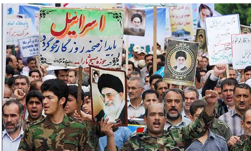
Israel should be wiped from the annals of history – Jerusalem Day, August 26, 2011

There is ample legal basis for the prosecution of Ahmadinejad and other Iranian leaders in the International Court of Justice and the International Criminal Court for direct and public incitement to commit genocide and crimes against humanity. 52