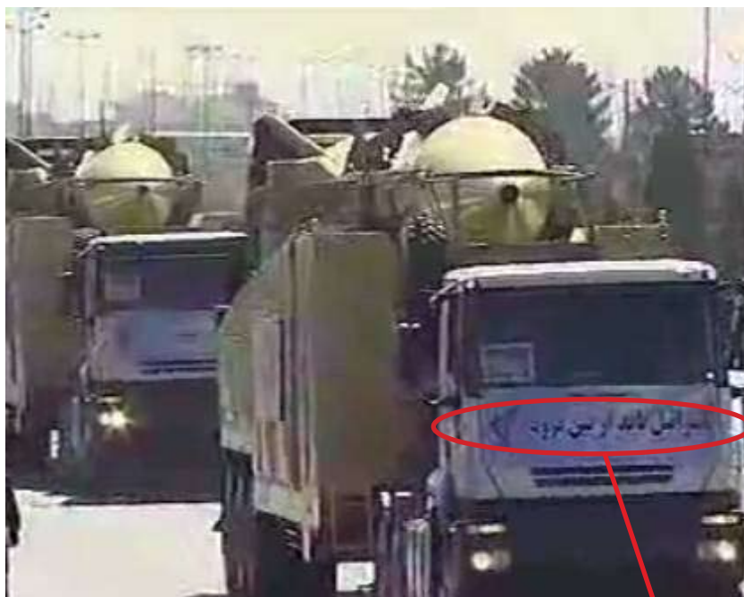
Footage of Shahab-3 missile transport vehicles on parade. Visible on the front is a draped slogan stating “Israel Must Be Destroyed.” Iranian Revolutionary Guard in Tehran, Islamic year 1389 (March 2010-March 2011) http://www.youtube.com/watch?v=UZpLFvcJaIM

Another variation of this theme was evident in last year’s military parade: