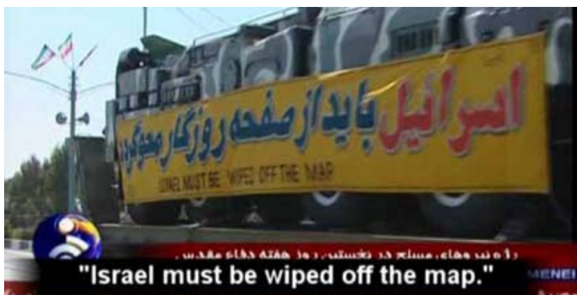
Footage from Tehran military parade, Channel 1 (Iran), IRINN TV (Iran), September 22, 2004

The Iranian Armed Forces regularly hold military parades in Tehran, which are also an important indication of regime intent. Usually featured are Iranian Shahab-3 missiles, which have a 1300-kilometer range that enables them to strike Israel. In these parades, the Iranians frequently fix signs on the transport vehicles carrying the missiles, which have read: “Israel must be wiped off the map.” The Iranians have even translated the text into English by themselves: