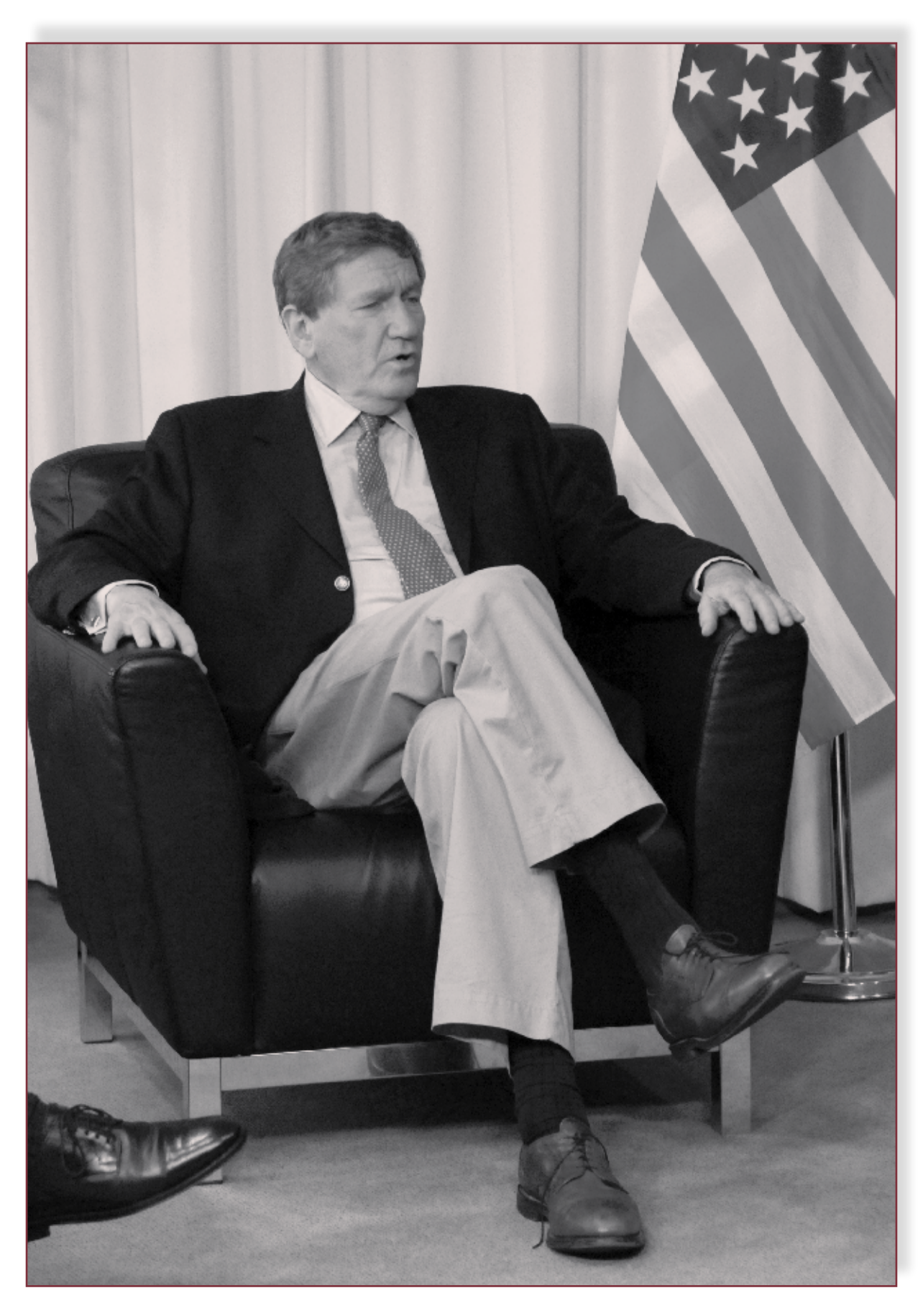
Ambassador Richard Holbrooke, U.S. Permanent Representative to the UN in 1999, sought to obtain for Israel the right of sovereign equality in the UN system, including the right to be elected to the UN Security Council.