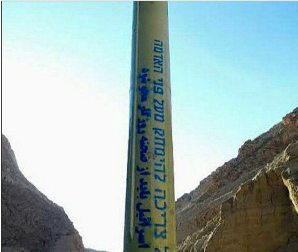
Missile from a recent Iranian test launch. "Israel must be wiped off the face of the earth" reads the inscription in Hebrew.

It was argued that the deal is a game-changer even from the point of view of the Israeli-Palestinian conflict. According to this approach, the current wave of Palestinian terrorist activities targeting Israeli civilians, which started by late 2015, is motivated by the understanding among Palestinians that with the new chapter of improvement in U.S.-Iran relations, the U.S. (and Iran) would focus on ISIS and ignore the Palestinian issue. Therefore, it is argued, the Palestinians should get out to the streets, carrying out violent and even terrorist activities, in order to be heard and not to let the international community ignore their plight.