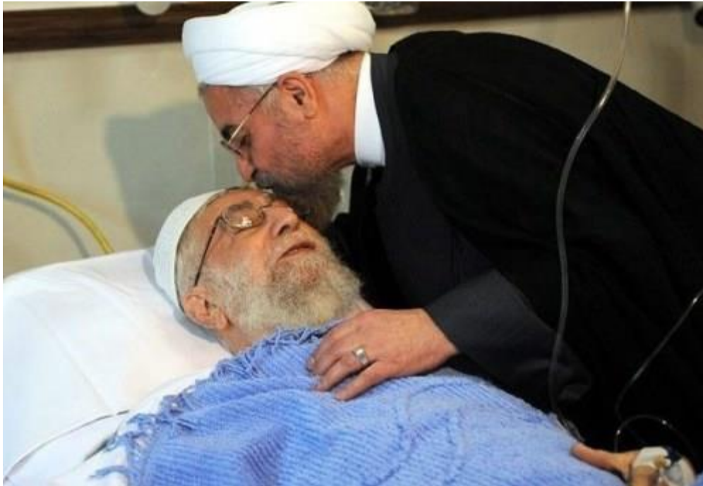
Iran's President Hassan Rouhani visited Ayatollah Khamenei in hospital after his 2014 surgery

The examination of Iran's post-JCPOA internal dynamics should be done through the eyes of three players – President Rouhani and the realist faction, the House of the Leader, and the IRGC. Such examination reveals, more than anything else, the actual dependency of each of them on the others despite the power struggle among them. Although the Rouhani-Zarif team is apparently the most popular one, domestically and internationally, it is the House of the Leader and the IRGC who have the control over the security-military forces and the country's financial entities. Therefore, the realist president who supports reforms in order to guarantee the survival of the regime will not be able, most probably, to implement any considerable social reform, as he has not initiated any major one so far, without the conservative-hardline bodies' consent, and this constraint is probably his significant weakness.