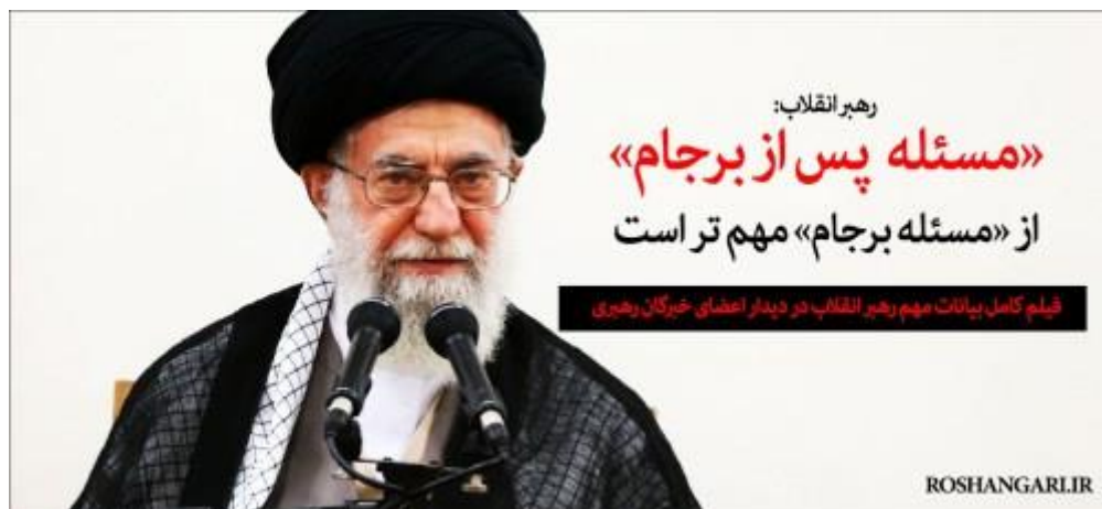
The Revolution's leader: "The post-JCPOA issue" is more important than "the JCPOA issue," the complete film of the leader's important statements at a meeting with the members of the Council of Experts.

These three regime's main players use the JCPOA for their own agenda and benefit. Although Rouhani's government announces every day a visit of another European leader in Iran, hinting on normalization and foreign investments, "there's nothing tangible for the people so far." Rouhani had not benefitted from the JCPOA yet and had still to cope with the challenges of the economy and corruption. This is the IRGC, according to this Iranian activist, who has benefitted the most so far from the post-JCPOA era and has utilized any opportunity to attack the moderate government.