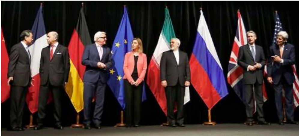
Iran Agreement in Vienna, July 14, 2015

From left to right: Foreign ministers/secretaries of state Wang Yi (China), Laurent Fabius (France), Frank-Walter Steinmeier (Germany), Federica Mogherini (EU), Mohammad Javad Zarif (Iran), Philip Hammond (UK), John Kerry (USA)