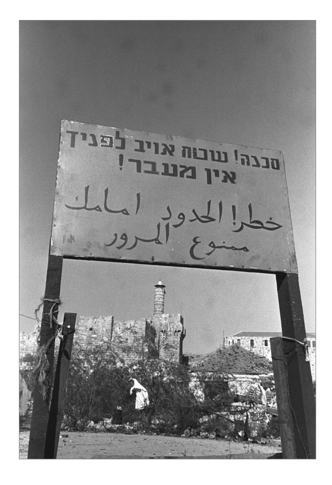
Sign: Danger! Enemy territory ahead. Do not cross!

approximately 1:00 pm, the Jordanians captured Armon Hanatziv and the surrounding area. However, within 40 minutes, an armored unit of the Israel Defense Forces (IDF) captured the High Commissioner's palace and its surroundings from the Jordanians.