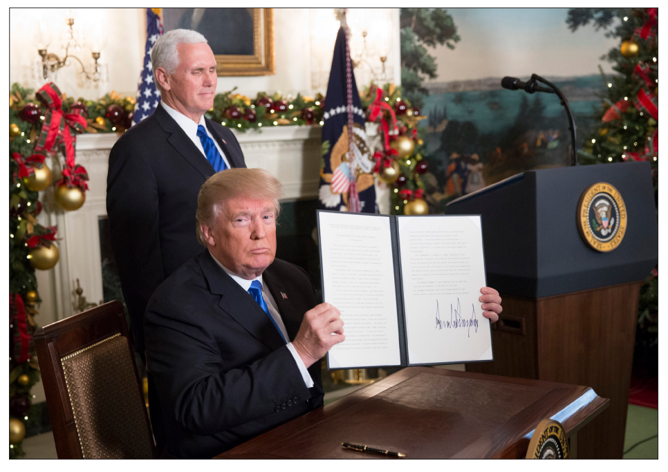
President Donald Trump shows a statement announcing intention to move the U.S. embassy in Israel to Jerusalem, December 6, 2017.

"undivided Jerusalem," and stressed that the United States "does not take a position on permanent issues, including the specific borders of Israeli sovereignty in Jerusalem." In this way, President Trump expressed his acquiescence in negotiations between Israel and the Palestinians regarding the issue of Jerusalem, including the Palestinian desire for two capitals, an Israeli capital and a Palestinian capital. The U.S. president further instructed the State Department to prepare for the transfer of the U.S. embassy from Tel Aviv to Jerusalem, scheduled for Israel's 70th Independence Day anniversary in May 2018.