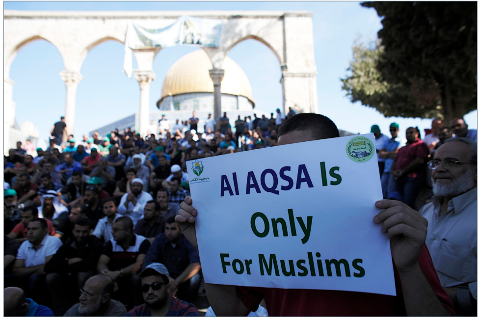
Palestinians demonstrate in front of the Dome of the Rock after clashes between Palestinian stone throwers and Israeli forces on the Temple Mount on September 27, 2015.