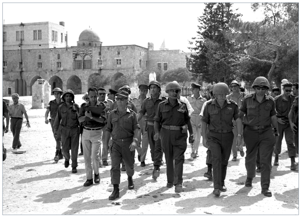
Defense Minister Moshe Dayan (center) visits the Temple Mount after its capture, June 7, 1967. Accompanying him (from right to left) Gen. Rehavam Zeevi, Chief of Staff Yitzhak Rabin, Dayan, and Gen. Uzi Narkis. Future president Chaim Herzog is in the third row, center.

Within hours of Israel's victory in Six-Day War and the unification of Jerusalem, the Minister of Defense at the time, Moshe Dayan, arrived on the Temple Mount and began to formulate the arrangements that would eventually be labeled "the status quo on the Temple Mount."<sup>30</sup> Dayan ordered the Israeli flag that had been raised at the site to be lowered and Israeli forces on the Temple Mount to be withdrawn to a position in the northern sector of the compound. In the days that followed, Dayan acted alone (without any decision by the Cabinet), consulting with only a few experts.