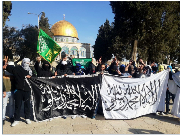
Murabitoun demonstrators on the Temple Mount

Israeli police, accustomed for years to having only a small minority of Jews wanting to visit the Temple Mount, were not prepared for this change. Time and again crowds waited in long and unnecessary lines, and harsh verbal exchanges ensued between those waiting to go up on the Temple Mount and the police on duty. There were instances where police prevented Jews from going up to the Mount. The increase in the number of Jews seeking to ascend to the Mount undoubtedly contributed to subjective Muslim perceptions that the status quo stood to be changed and the Mount stood to be lost and "conquered." In fact, Israel did not allow these changes in halakhic rulings to change the human landscape on the Mount. The number of Jews who annually sought to go up on the Mount did not exceed 15,000, while each year hundreds of thousands of Muslims visited there.<sup>81</sup>