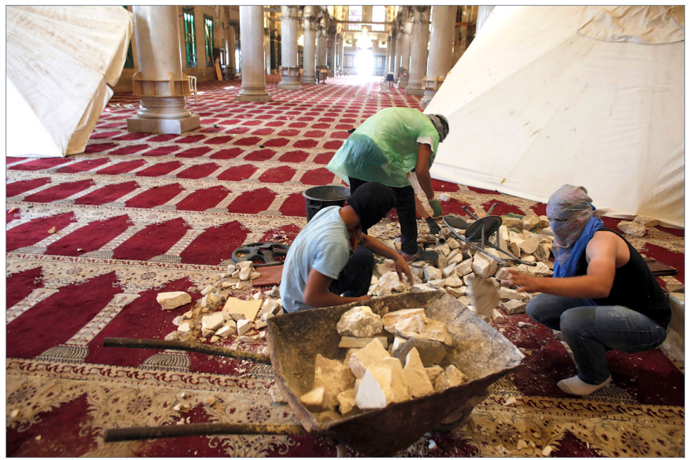
Masked Palestinians prepare stones inside Jerusalem's al-Aqsa Mosque, one of Islam's holiest sites, on September 27, 2015.

clashes on the Temple Mount, Jordan announced that it was recalling its ambassador to Israel for consultations and was even re-examining its 1994 peace treaty with Israel against the backdrop of what Jordan labeled "Israel's aggression in the holy places to Islam in Jerusalem."