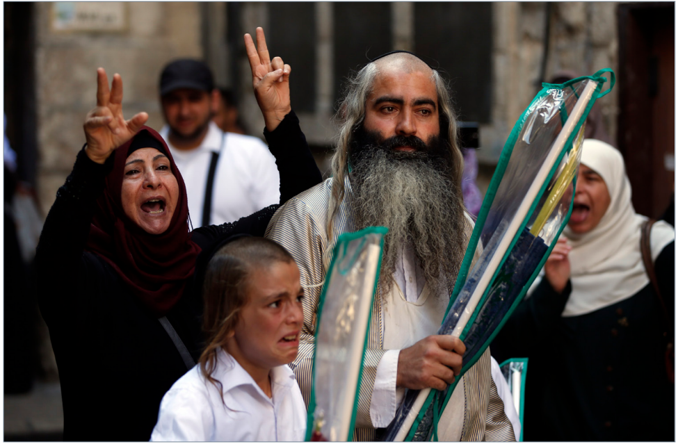
A Jewish boy cries as he and his father walk past Palestinian murabitat protesters.

This is the backdrop to this study, which briefly surveys the history of the status quo on the Temple Mount, presents the reasons for its establishment, details the many substantive changes it has undergone, and explains the reasons behind these changes. The questions at the heart of this study are: "Does the status quo still exist?" What form does it take? And, to what extent is it still relevant today?