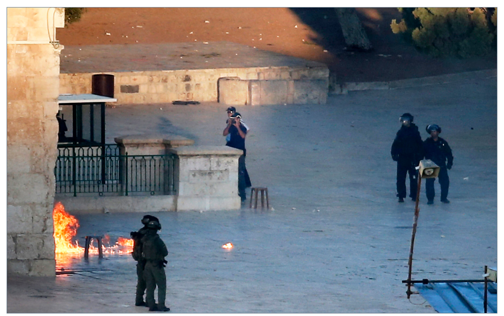
Israeli security forces stand guard at one of the main entrances of the al-Aqsa mosque as Palestinians throw firebombs from inside the mosque.

The severe incidents on the Temple Mount were accompanied by extreme incitement in which the Palestinian Authority played a core role.<sup>18</sup> During these months, incidents of violence and incitement against Jews on the Temple Mount escalated into severe riots. The pronouncements of the head of the Palestinian Authority, Mahmoud Abbas, that Jews defiled al-Aqsa and that their entrance to the Temple Mount should be prevented at all costs, added more fuel to the fire. <sup>19</sup> In the course of three days, Palestinian state television broadcasted Abbas' words of incitement 19 times.<sup>20</sup>