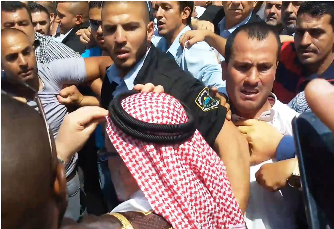
Mob attacking a Jordanian religious figure (wearing the red kaffiya) outside of the al Aqsa Mosque in Jerusalem, May 2015. 18

This situation changed completely after two Jordanian officials were expelled out of the mosque in disgrace by a violent Palestinian mob in May 2015. 17