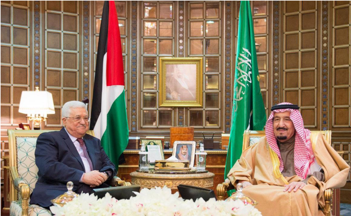
PA President Mahmoud Abbas received by King Salman in Riyadh Saudi Arabia, December 21, 2016.