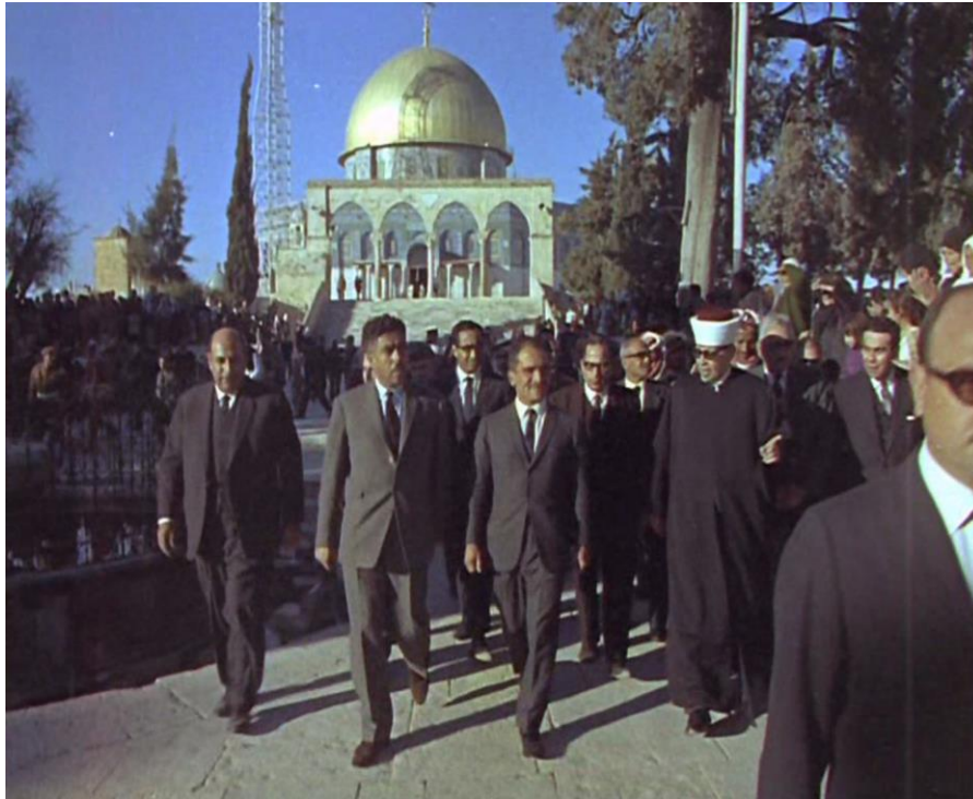
King Hussein (center) visiting Temple Mount in Jerusalem in May 1967, one month before the "Six Day War."

rejection," but if there was no other way, internationalization should apply to both parts of Jerusalem – east and west.