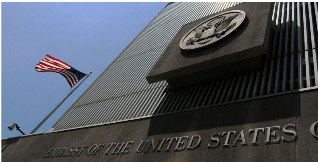
The U.S. Embassy building in Tel Aviv