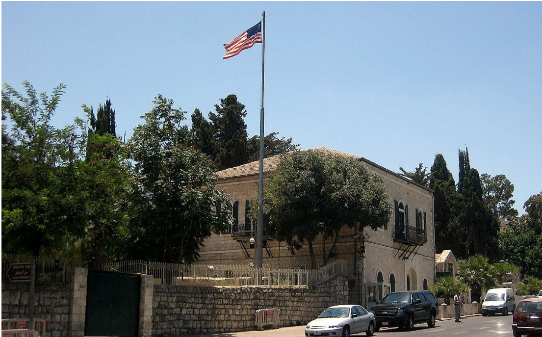
U.S. Consulate Building in (west) Jerusalem

threatened Israel with a new wave of violence. Oddly enough, losing Palestinian Authority rule and security control over areas of the West Bank were considered to be major security threats towards Israel; yet the Palestinian Authority is the one levelling threats of violence. In any case, as far as Jerusalem is concerned, in Palestinian eyes, it is a "win-lose" situation, with no room for a "win-win" compromise.